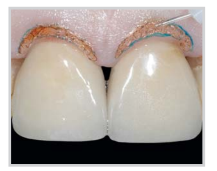
Figure 1. Diode lasers provide unsurpassed operator control, allowing for precise tracing of a pre-established incision design.

the area to be treated is located supragingivally (eg, in cases where gingival inflammation is present, posing a risk of bleeding in conjunction with the attendant increase in crevicular fluid flow).