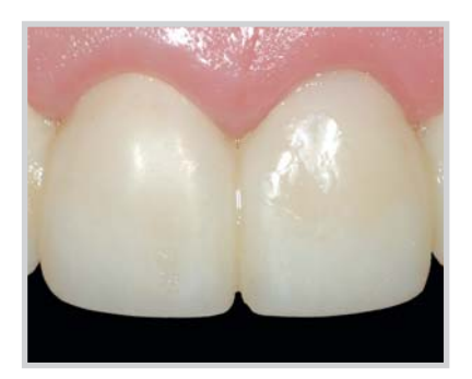
Figure 4. Postoperative appearance two weeks following laser-assisted esthetic crown lengthening with immediate provisionalization.

tip either in contact to cut or in close proximity to treat the target area. The unit under evaluation includes an aiming light to facilitate guidance of the laser beam during non-contact use. Placement of the tip directly in contact with the surgical site for cutting, however, enhances tactile feedback while providing the operator with a sense of familiarity relative to other dental cutting or drilling procedures. Power settings are adjustable, and the laser beam may be delivered in a constant or pulsed mode.<sup>7</sup>