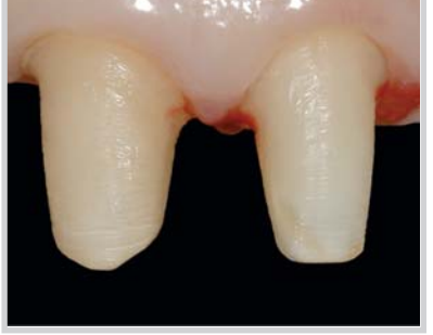
Figure 5. Preoperative view of abutment(s) prior to definitive impressions. Please note inflamed tissues and presence of bleeding.

facilitates the immediate fabrication of a provisional restoration, avoiding the exposure of subgingival root surfaces and open embrasure spaces. This is a distinct advantage in the management of the esthetically aware patient. Laser surgery is well tolerated by the tissues, and the short-term healing response compares favorably to scalpel incisions and electrosurgery (Figure 4).<sup>6</sup> Pre-Impression Gingival