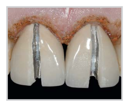
Figure 3. The diode laser may be utilized to perform a bloodless external bevel gingivectomy, facilitating the immediate placement of provisional restorations.

From a technical perspective, the diode laser may be used with the fiber