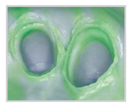
Figure 7. Access to preparation margins coupled with adequate moisture control results in consistently successful impression taking.